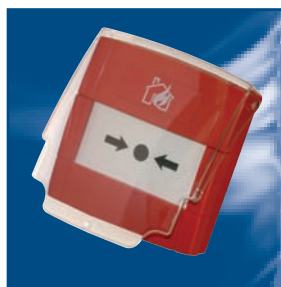
MCP Hinged Cover

Fitting a transparent hinged cover to a call point provides additional protection from accidental operation. They are particularly useful in high traffic areas such as stairwells and corridors in schools and public buildings, where the volume of traffic can result in accidental operation of the call point causing nuisance alarms.