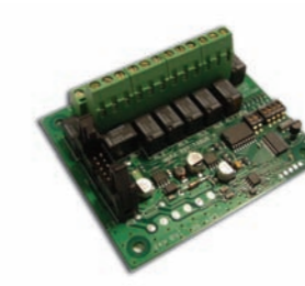
3100CCI Zonal Clean Contact Interface

The 3300/RP Repeat Panel mimics all the indications and user functionality of the main panel as detailed previously. A maximum of 8 repeat panels can be connected to the 3300 panel using the external expansion port communications using 4 core screened cable +24V DC, 0V, Data+ and Data-.