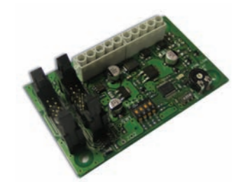
3100FLI Fire Link Interface

The 3100CCI provides a clean contact output per zone and can be configured (using on board DIL switches) to operate the relevant contacts on automatic zone activations, manual zone activations, any zone activations or any zone faults. To allow differentiation between manual or automatic zone activations, Protec 3000/MCP manual call points must be fitted.