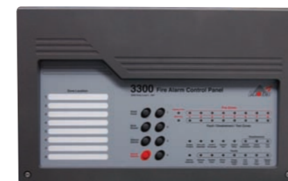
3300/RP Repeat panel

The 3300/RP Repeat Panel mimics all the indications and user functionality of the main panel as detailed previously. A maximum of 8 repeat panels can be connected to the 3300 panel using the external expansion port communications using 4 core screened cable +24V DC, 0V, Data+ and Data-.