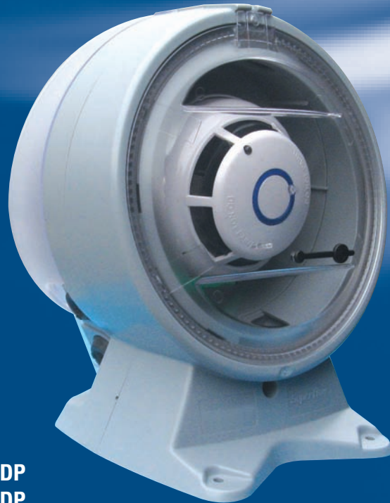
3000/UG4DP 6000/UG4DP 6000PLUS/UG4DP