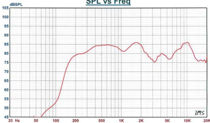
SPL vs Freq