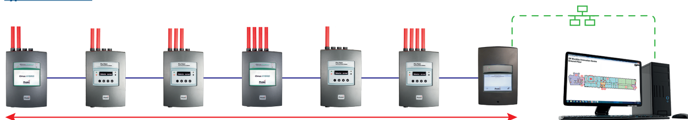
Maximum 98 Protec aspirating detectors on RS485 wired network Maximum 1.2km RS485 network length with one ADRDP (can be extended using multiple ADRDPs)